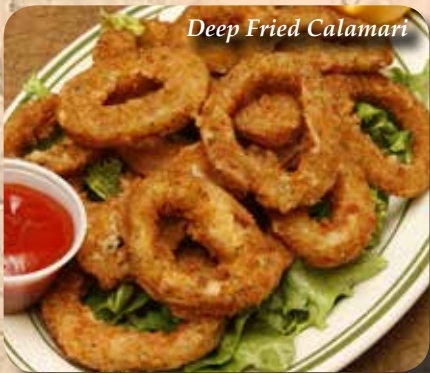
Deep Fried Calamari