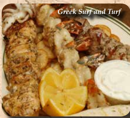
Greek Surf and Turf

Ten sticks of pork cubed into 1-inch chunks skewered on wooden skewers and broiled over charcoal