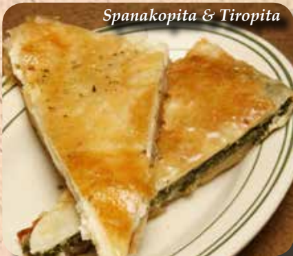
Spanakopita & Tiropita