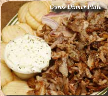
Gyros Dinner Plate