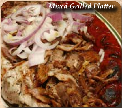
Mixed Grilled Platter

Calamari barbecued to perfection and glazed with olive oil, lemon and oregano