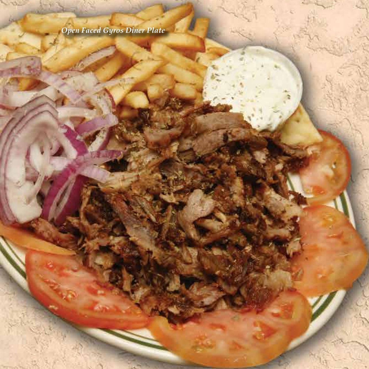
Open Faced Gyros Diner Plate