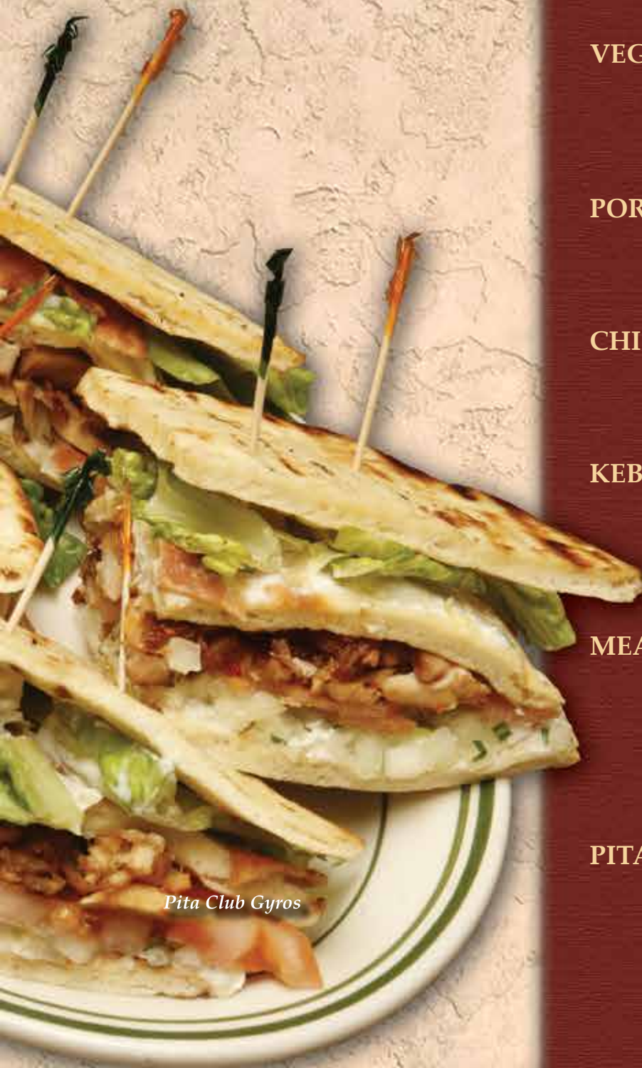
Pita Club Gyros

All items are made and served fresh daily